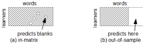
Figure 1: Two problem settings; (a) in-matrix, (b) out-of-sample.